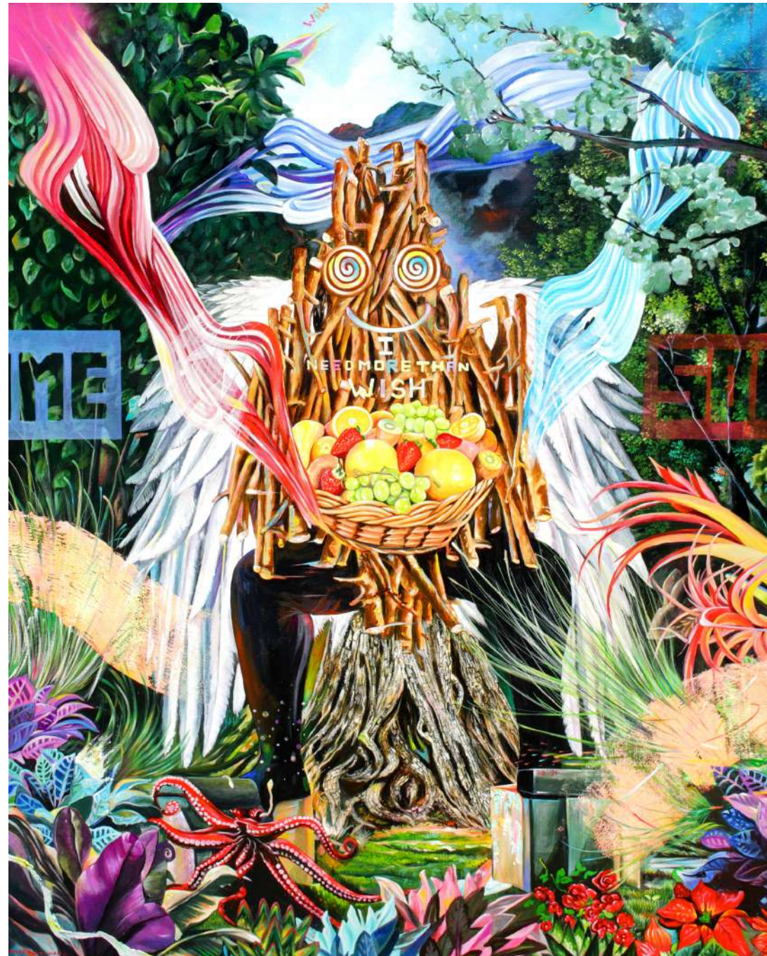
More than Wish