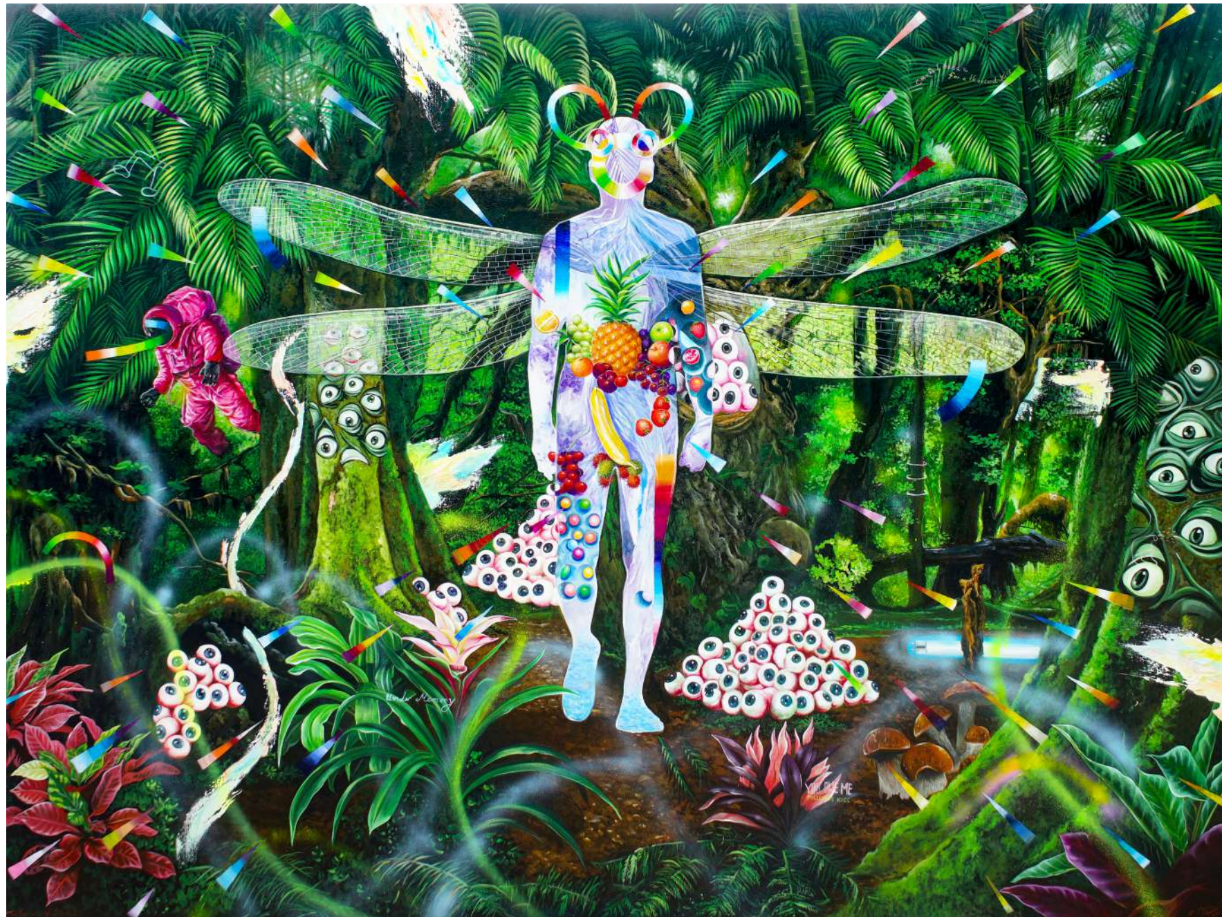
The Shadow of Shadow