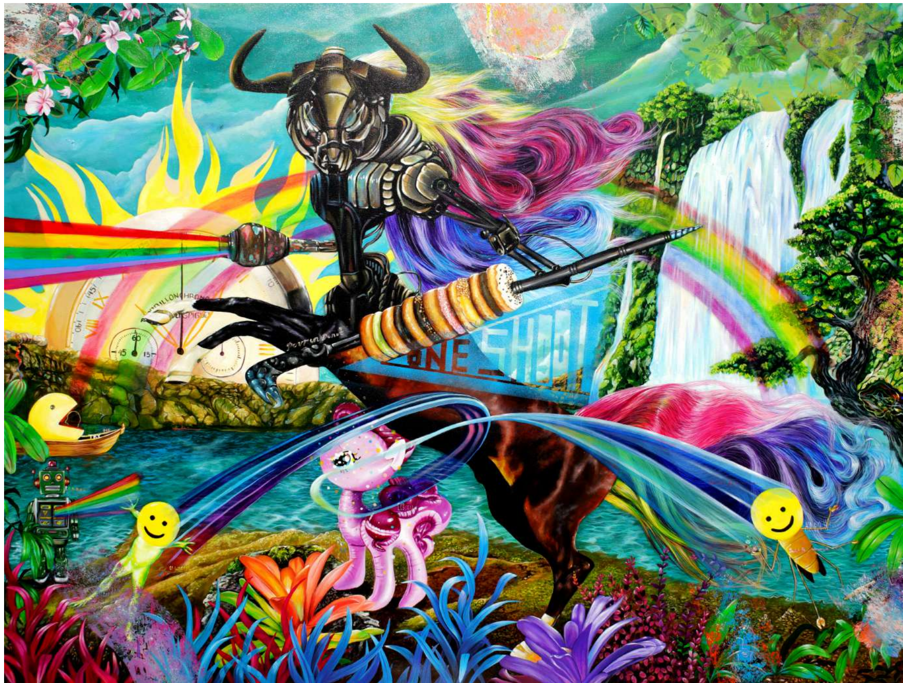
One Shoot for One Donut