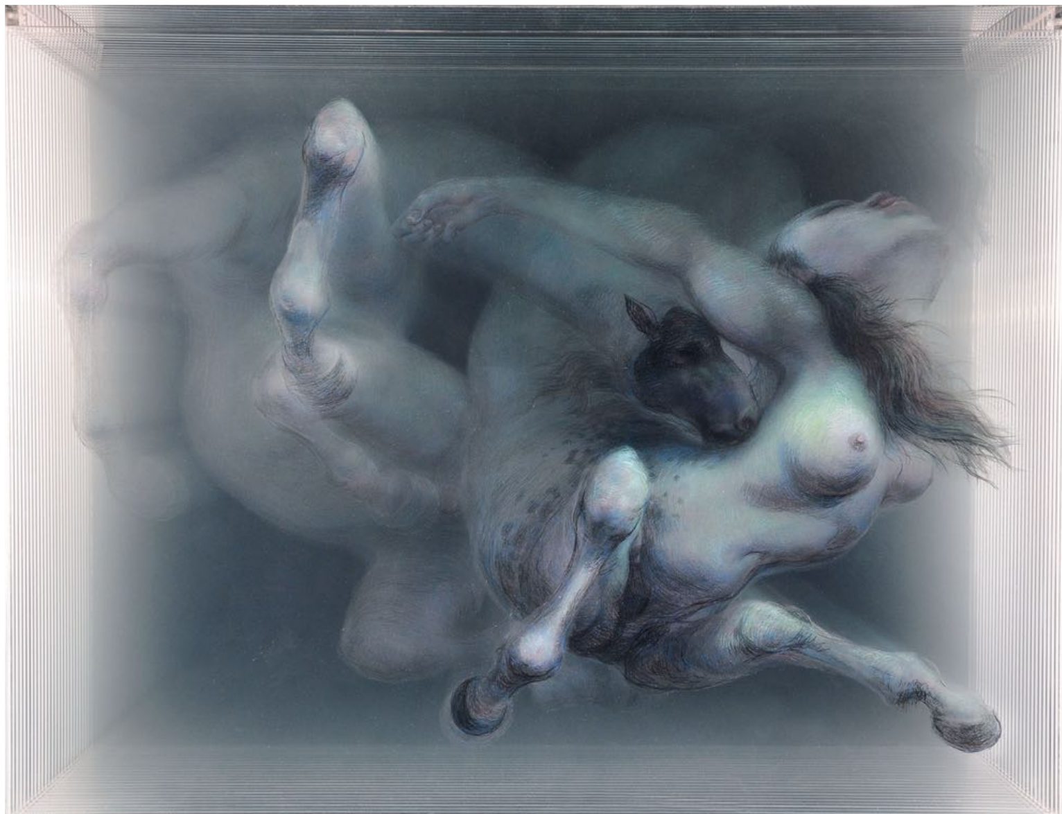
Horse No.4 马之四, 24 pieces of 6mm glass, 83.5 × 67 × 46 cm, 2013